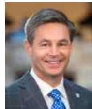
Sen. Matt Dolan (R-Cleveland)