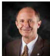
Sen. Dave Burke (R-Marysville)