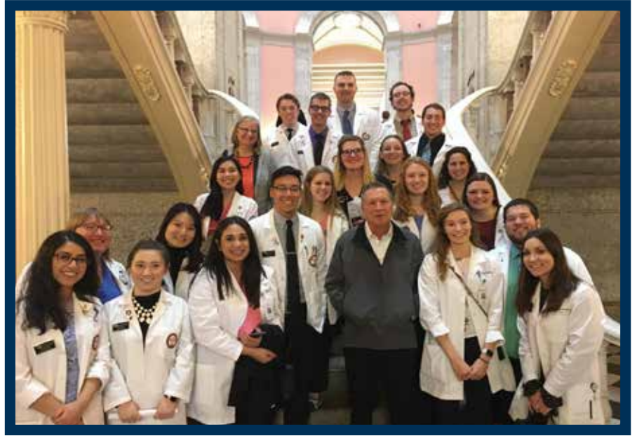
At the Ohio Statehouse, student advocates pose with Governor John Kasich during the 2018 Student Pharmacist Legislative Day.

Student Legislative Day is an advocacy event that allows student pharmacists to meet with legislators to educate them about the value of pharmacists in the world of health care. You will learn about the latest legislative issues in the Ohio Statehouse, learn how to effectively communicate those issues, hear from the legislators themselves, and have a chance to individually visit the offices of legislators. This program will allow you to learn and become involved in the issues impacting Ohio pharmacy practice. We'll discuss new pharmacist-payment models, Medicaid, PBM reform, new laws from 2019, scope of practice expansion, and other critical pharmacy issues.