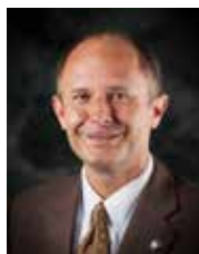
Sen. Dave Burke (R-Marysville)