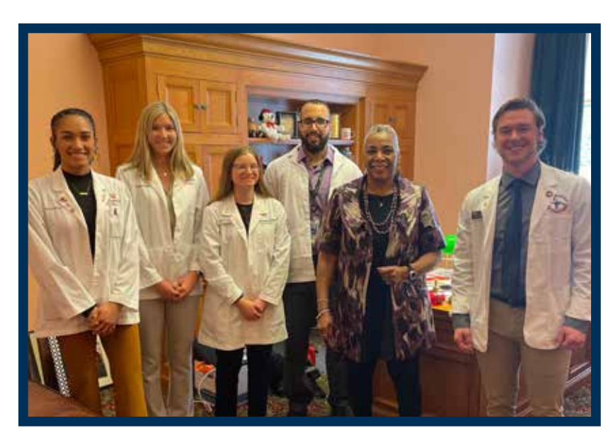
Student pharmacist advocates meet with Ohio State Senator Catherine Ingram during the 2023 Student Pharmacist Legislative Day.

Student Pharmacist Legislative Day is an advocacy event that allows student pharmacists to meet with legislators to educate them about the value of pharmacists on the health care team. You will learn about the latest legislative issues at the Ohio Statehouse, learn how to effectively communicate those issues, hear from the legislators themselves, and have a chance to individually visit their offices. This program will allow you to become involved in the issues impacting your future pharmacy practice in Ohio.