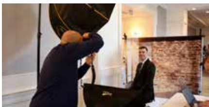
2024 OPA Conference attendee sits for new head & shoulders photo, sponsored by NPX.